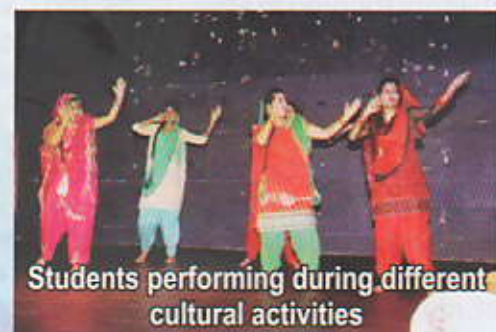
Students performing during different cultural activities

The students participate in various cultural activities, especially from the Music Department. Students participate in State and National Level programmes and have brought laurels to this college.