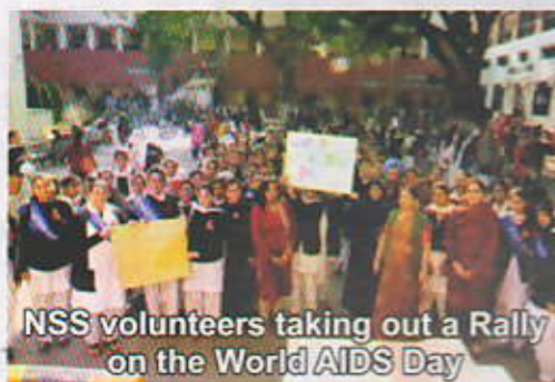
NSS volunteers taking out a Rally on the World AIDS Day

National Service Scheme (NSS) aims at arousing social consciousness of the youth with an overall objective of personality development of the students through community service. The college has 4 units, having one Programme officer and 100 students in each unit. They are required to extend 120hrs of social service per year besides participation in two camps organized by the NSS unit of the college. Students are given certificates by University of Jammu for rendering service in the field. The activities include: Improvement of campus, constructive work in adopted villages and tree plantation.