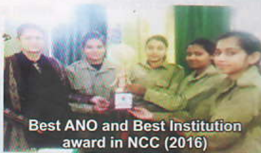
Best ANO and Best Institution award in NCC (2016)

The aims of NCC are: To develop qualities of character, courage, camaraderie, discipline, leadership, secular outlook, spirit of adventure and the ideals of selfless service amongst the youth of the country. To create a human resource of organized, trained and motivated youth, to provide leadership in all walks of life and be always available for the service of the nation. To provide a suitable environment to motivate the youth to take up a career in the armed forces. The students get enrolled with the in-charge of the NCC unit of the college.