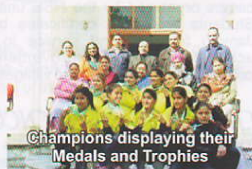
Champions displaying their Medals and Trophies

The College has a well developed play field with defined courts for various games Students participate in various sports activities.