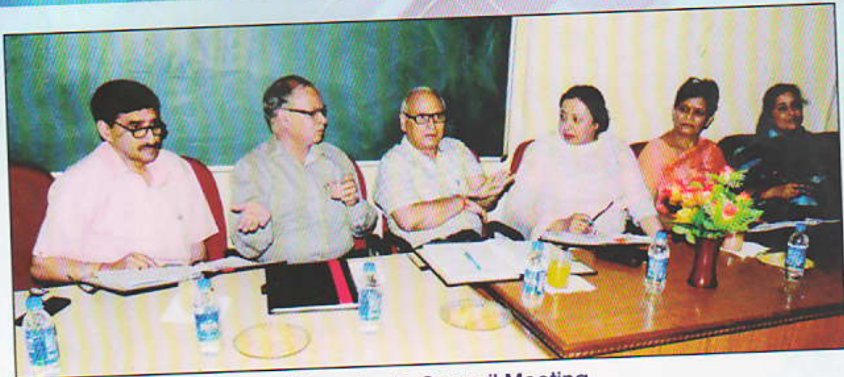
5 th Academic Council Meeting