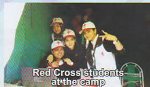
Red Cross students at the camp

The College took an initiative in the establishment of "Youth Red Cross Unit" under the auspices of Indian Red Cross Society with the objective of providing awareness to society regarding health related issues.