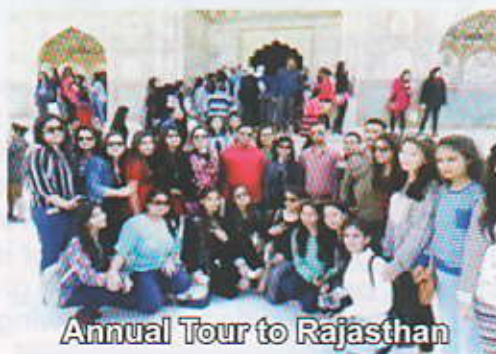
Annual Tour to Rajasthan

A number of tours and picnics are organized in college to the places of educational and historical importance. Students are selected for the tours on the basis of merit. Subject tours in Commerce, Botany, Home Science and Zoology are also conducted within the State.